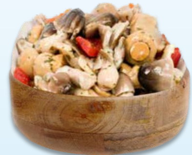
ANTIPASTI SICILIANI RIZZO MARINATED MIXED MUSHROOMS NET WT: 6.6 lb (3 kg)