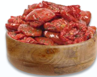
ANTIPASTI SICILIANI RIZZO MARINATED SEMI-DRIED CHERRY TOMATOES NET WT: 6.6 lb (3 kg)