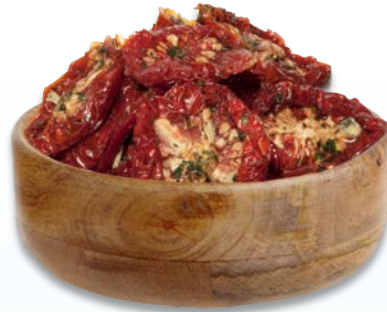
ANTIPASTI SICILIANI RIZZO MARINATED SUN-DRIED TOMATOES NET WT: 6.6 lb (3 kg)