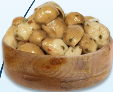
ANTIPASTI SICILIANI RIZZO PORCINI MUSHROOMS NET WT: 6.6 lb (3 kg)