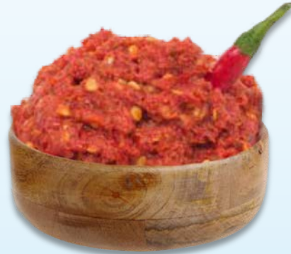
ANTIPASTI SICILIANI RIZZO CALABRIAN CHILI PEPPERS SPREAD NET WT: 6.6 lb (3 kg)