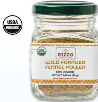
ANTIPASTI SICILIANI RIZZO WILD FENNEL POLLEN Size: 3.53 oz (100 g)