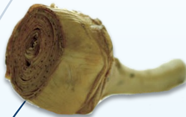
RANONI ARTICHOKES WITH STEM Azienda Agricola Ranonico NET WT: 6.4 lb (2.9 kg)