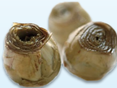
RANONI ARTICHOKES HEARTS Azienda Agricola Ranonico NET WT: 3.5 lb (1.6 kg)