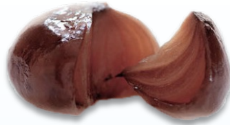
RANONI BALSAMIC ONIONS Azienda Agricola Ranonico NET WT: 3.5 lb (1.6 kg)