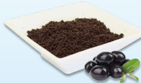
PachinEat GROUNDING BLACK OLIVES Size: 1 lb (454 g)