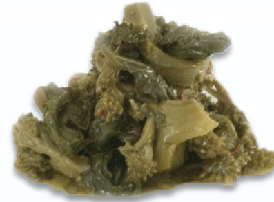
RANONI BROCCOLI RABE Azienda Agricola Ranonico NET WT: 3.5 lb (1.6 kg)