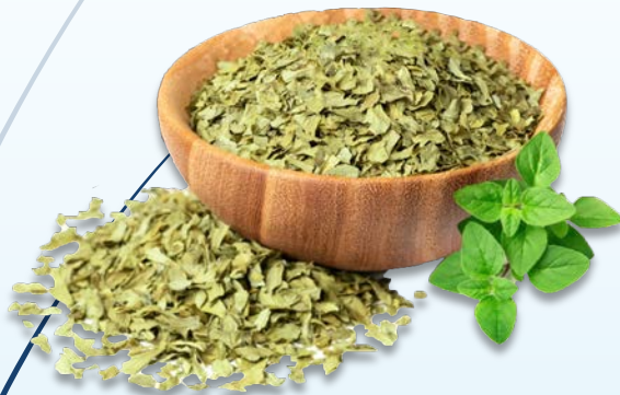
ANTIPASTI SICILIANI RIZZO SICILIAN OREGANO Size: 7.05 oz (200 g)