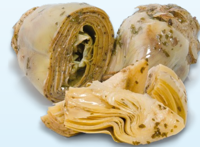
ANTIPASTI SICILIANI RIZZO MARINATED QUARTERED ARTICHOKES 1980 NET WT: 6.6 lb (3 kg)