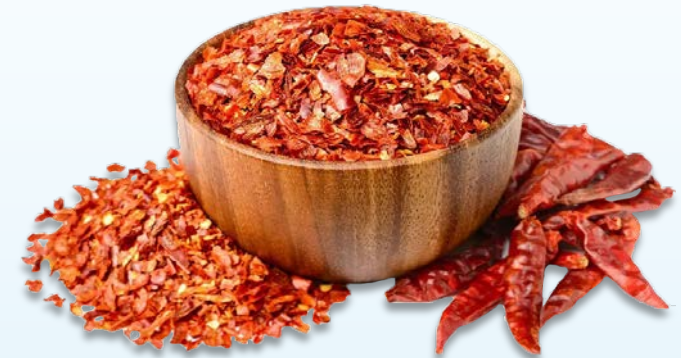
ANTIPASTI SICILIANI RIZZO CRUSHED CHILI PEPPERS Size: 14.11 oz (400 g)